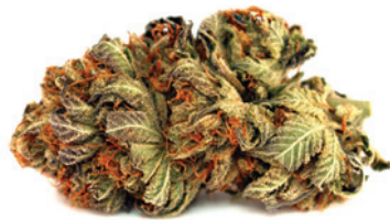
Fresh Green Harsh