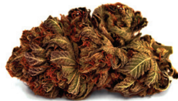
Curó Cured Cannabis Smooth

Thirteen Month - Purple Warlock Cure. Mid-Harvest Indica.